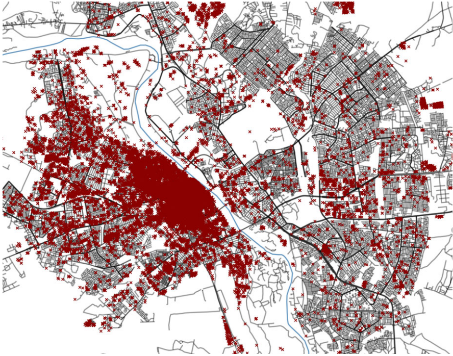
FIGURE 1. Satellite-assessed damage in Mosul

follow procedures that people see as fair. 41 At its most basic, legitimacy is a condition that inheres “when people are influenced by an authority or institution not by means of the use of power but because they believe that the decisions made and rules enacted by that authority or institution are in some way ‘right’ or ‘proper’ and ought to be followed.” 42 Legitimacy therefore tends to increase the likelihood of obedience to authorities, which can be observed in behavioral outcomes, including compliance with tax obligations, court decisions, and public health regulations. 43